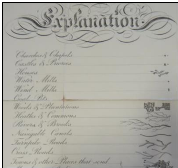
Extract showing the map key